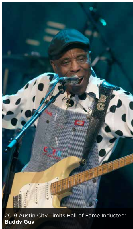
2019 Austin City Limits Hall of Fame Inductee: Buddy Guy