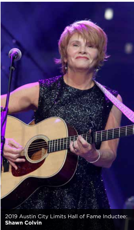
2019 Austin City Limits Hall of Fame Inductee: Shawn Colvin