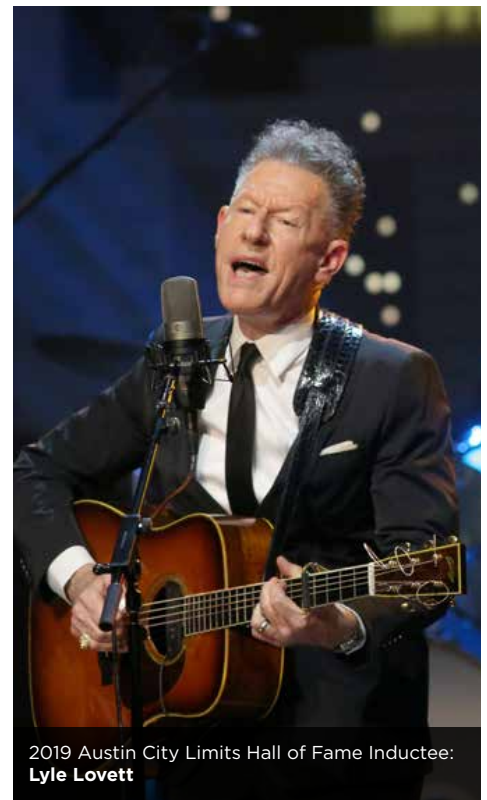
2019 Austin City Limits Hall of Fame Inductee: Lyle Lovett